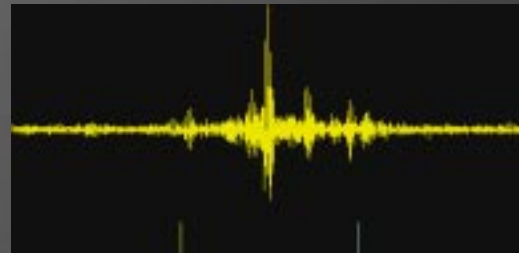
Actual DigiCorr recording of multiple leaks in a daytime urban environment